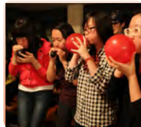
Above: Ascenders having fun and playing games