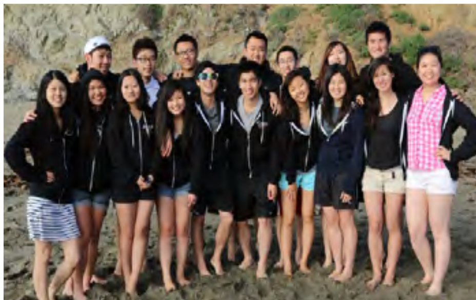
Above: Spring 2013 Officers posing for a picture

On Friday, March 1st, Social Committee organized the first casual social event for Ascend: Karaoke Night at Chatime! Members had the chance to sing various songs ranging from Chinese and Korean pop to old classics while enjoying some delicious Boba. After over two hours of singing (and some shouting), the participating members departed unwillingly. What a great way for members to de-stress from midterms and essays!