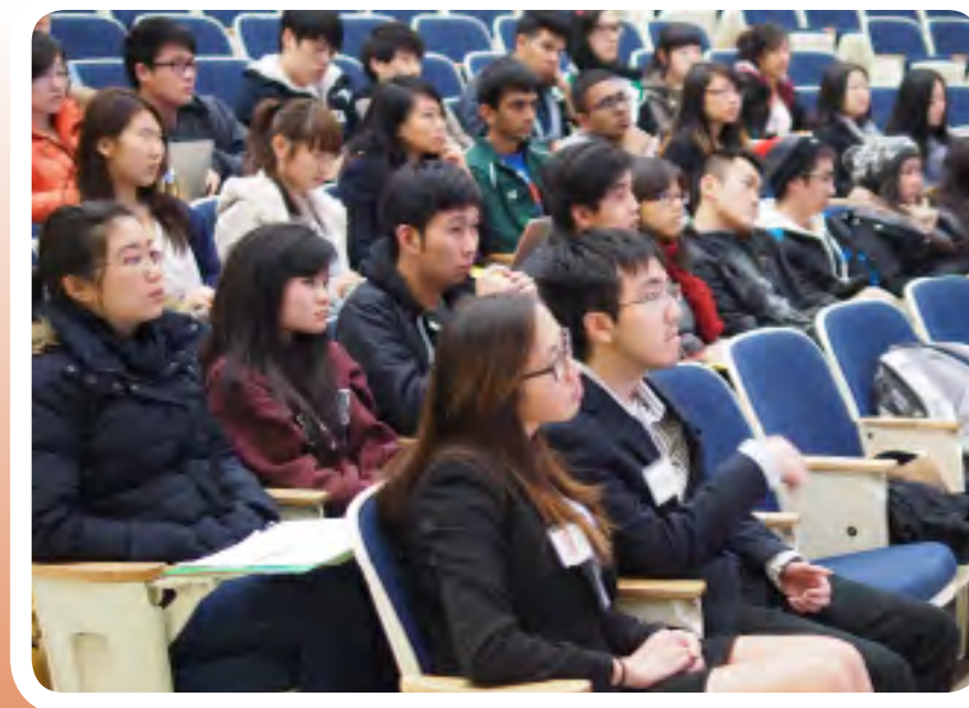
Left: Ascenders listening to the presentation