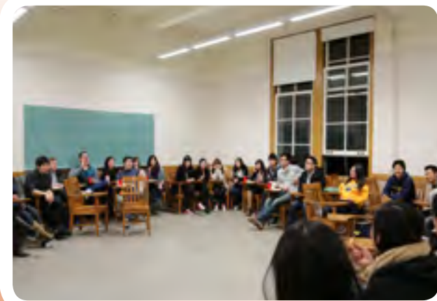
Above: Ascenders playing team bonding games