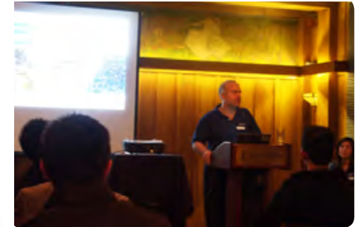
Above: Abbott representative presenting

The Career Development Committee and IABC co-hosted an event with Abbott Laboratories where professionals from the company spoke about their corporate finance career opportunities. Abbott Laboratories is a leading health care company located in more than 60 countries around the globe. Professionals discussed their personal experiences and showed the audience the company's unique working dynamic and culture. Furthermore, students were able to learn more about the various career paths Abbott offers and how to begin a successful career in corporate finance.