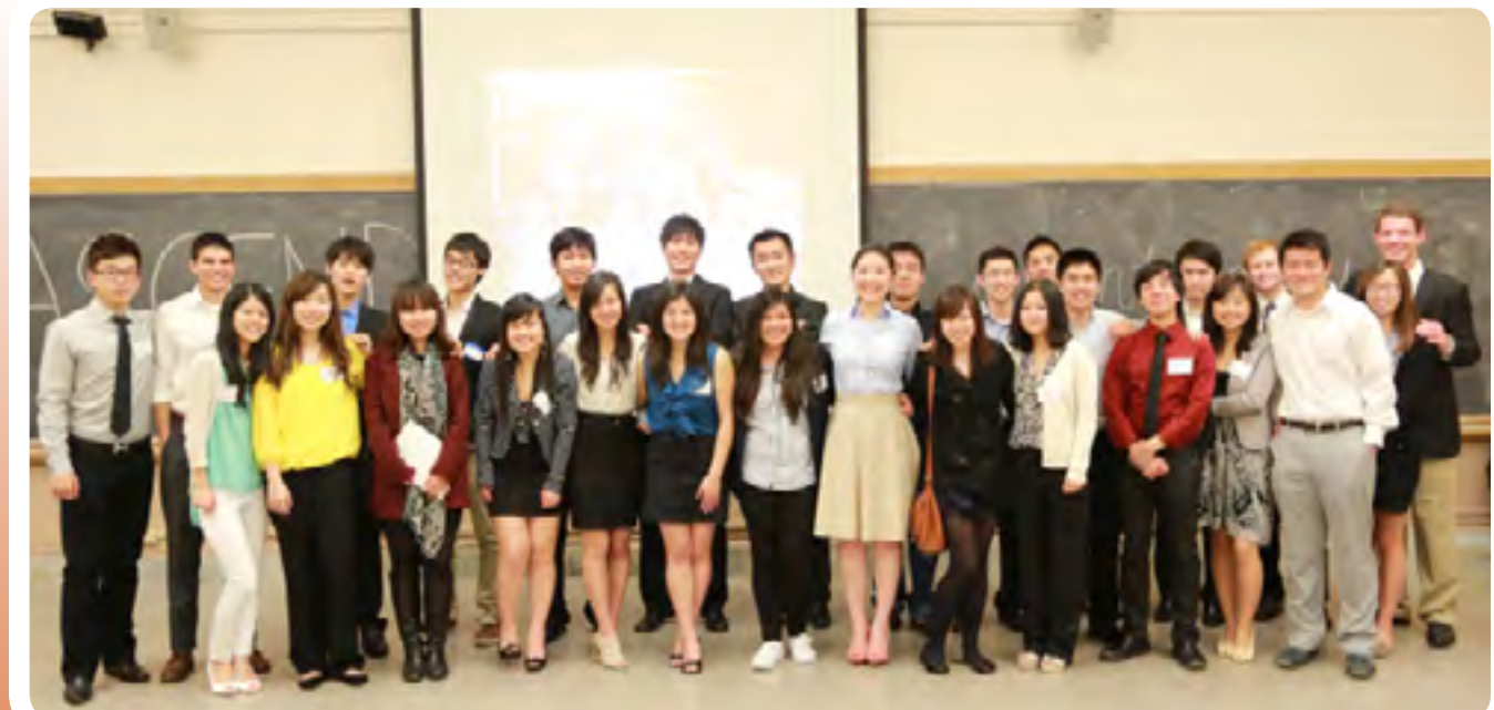
Pre-interview social attendees having a wonderful time