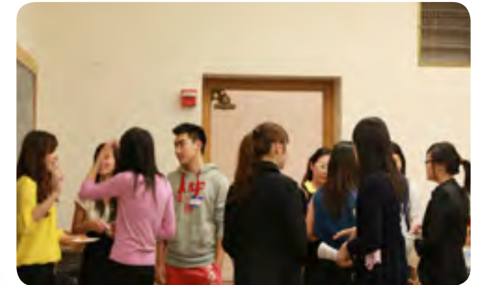
Above: Ascenders interacting with the officer team

On Friday, February 1st, Ascend hosted the Pre-interview Social in Wheeler Hall. It was a great opportunity for students who were interested in Ascend to get to know the officers on a more personal level. All officers were present to answer questions about our great business organization and inform the attendees of the application process. Students had the chance to talk with both officers and participating alumni about their own unique experiences in Ascend. Many of the students who attended our Pre-interview Social actually became committee members!