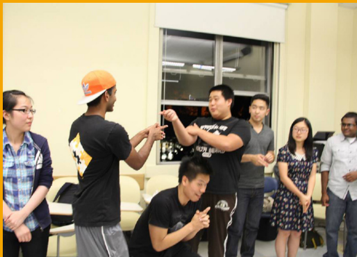
CM Welcome Night