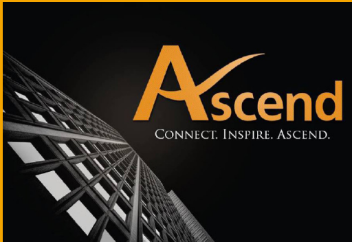
Ascend's 2013 Fall Semester Official Flyer