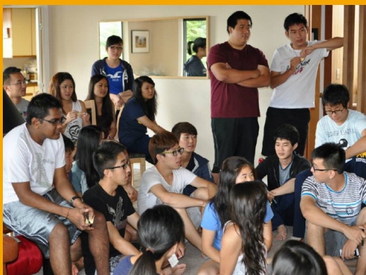
General Member Retreat